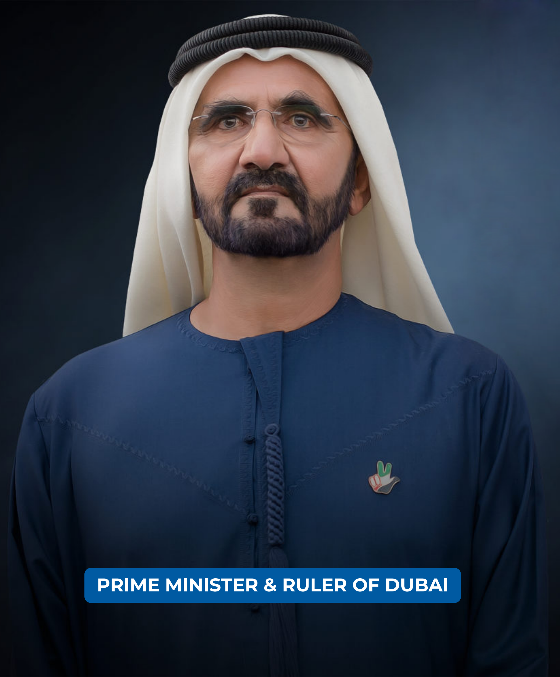
PRIME MINISTER & RULER OF DUBAI